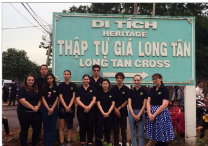
Simpson Prize Tour winners and chaperones outside Long Tan